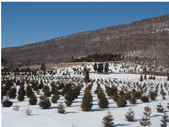
Winter at Glenview Farm. The Appalachian Trails in on the Kittatinny Ridge in the background.