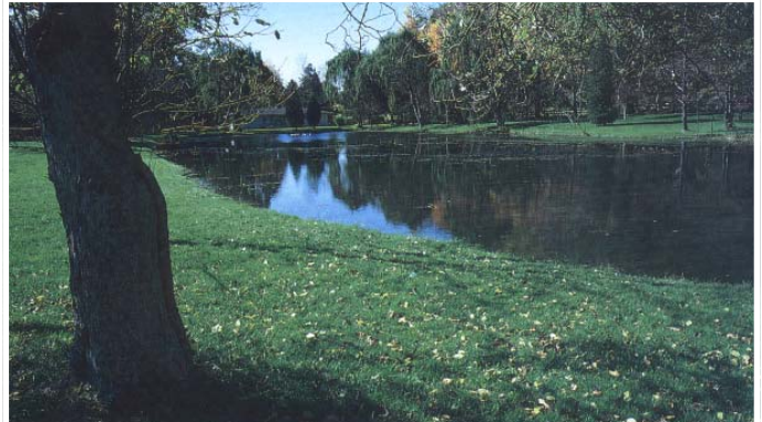
Sixty area pond receives millions of gallons each day from Mountainwood Spring (in background).

RVC acquired an easement on 68.5 acres of the 77-acre property in Hardwick for $500,000 in February by agreement with the owners William and Carolyn Eagan. The Eagans have a commercial spring-water business on part of the property, but their extraction rate is limited to less than 100,000 gallons per day through a deed restriction imposed by Hardwick Township. The Eagans shared a common desire with RVC see the forest that supplies recharge to the spring permanently protected. The property is extremely valuable and several interested parties sought aggressively to obtain it. RVC and the Eagans, including their sons John and Alexander who are also involved in the spring-water business, arrived at a way to preserve most of the property and allow public access via a hiking trail that allows users sweeping views of the spring pond and access to the fascinating terrain of the surrounding limestone forest.